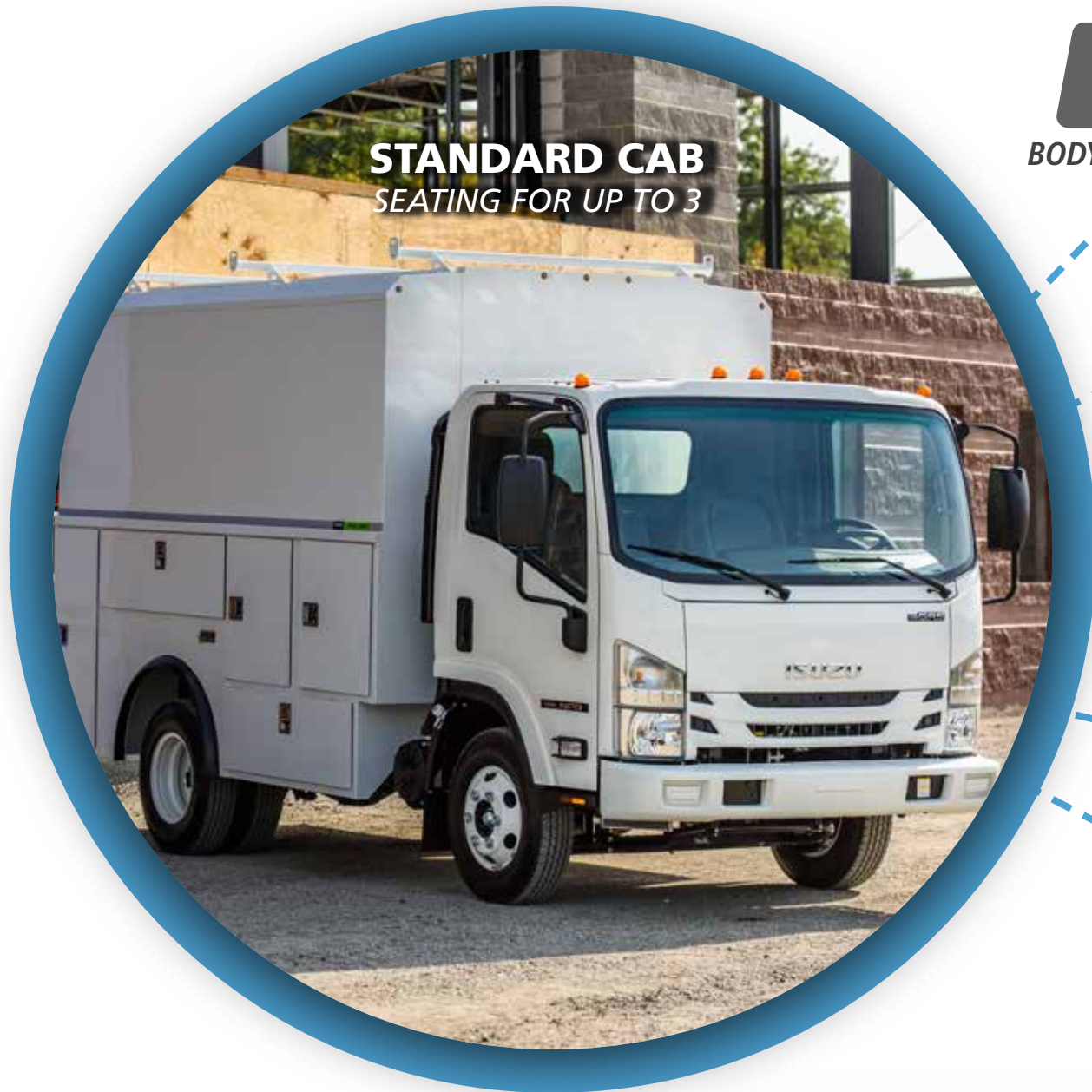
STANDARD CAB SEATING FOR UP TO 3