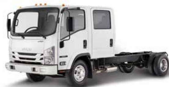
CREW CAB SEATING FOR UP TO 7